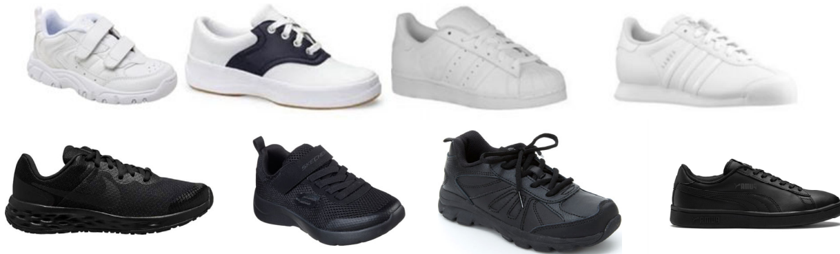
Examples of what not to wear: